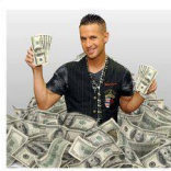
what the govt. thinks i do