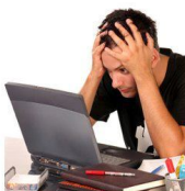
what it's really like