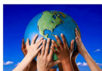
what i think i do