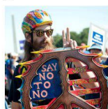
what my friends think i do