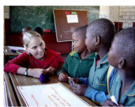
what my parents think i do